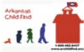
Arkansas Special Education