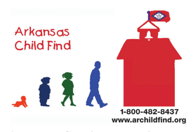
Arkansas Special Education